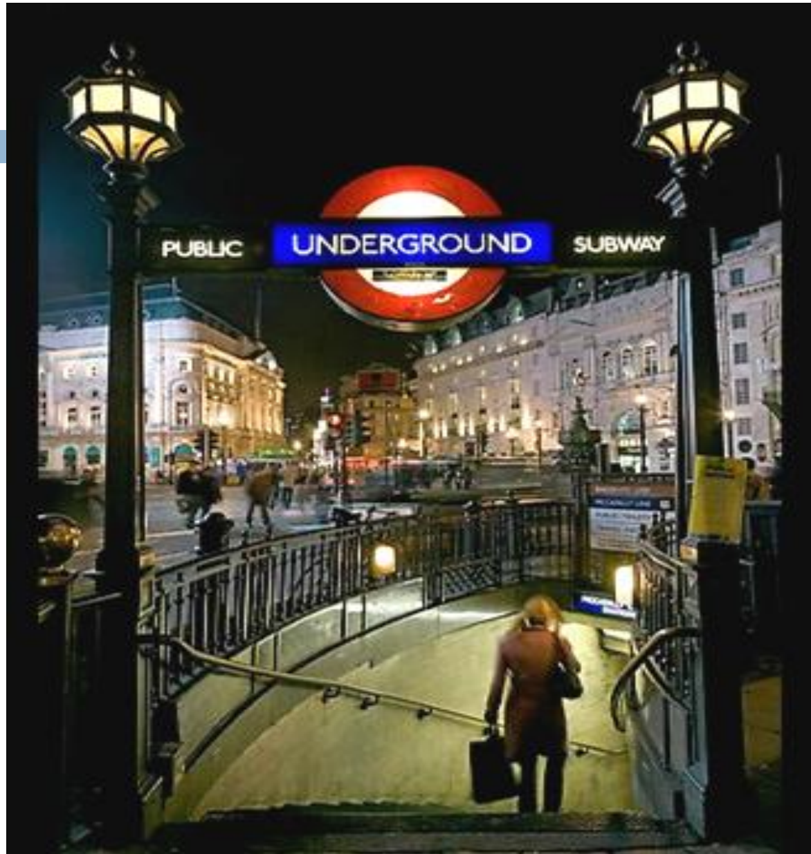
Subway, Piccadilly Circus