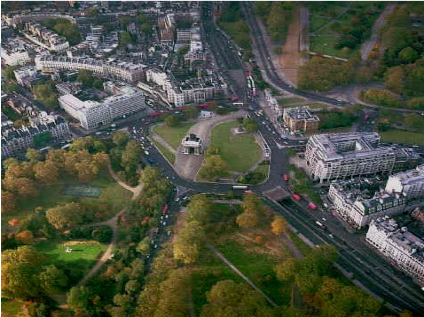
Hyde Park Corner