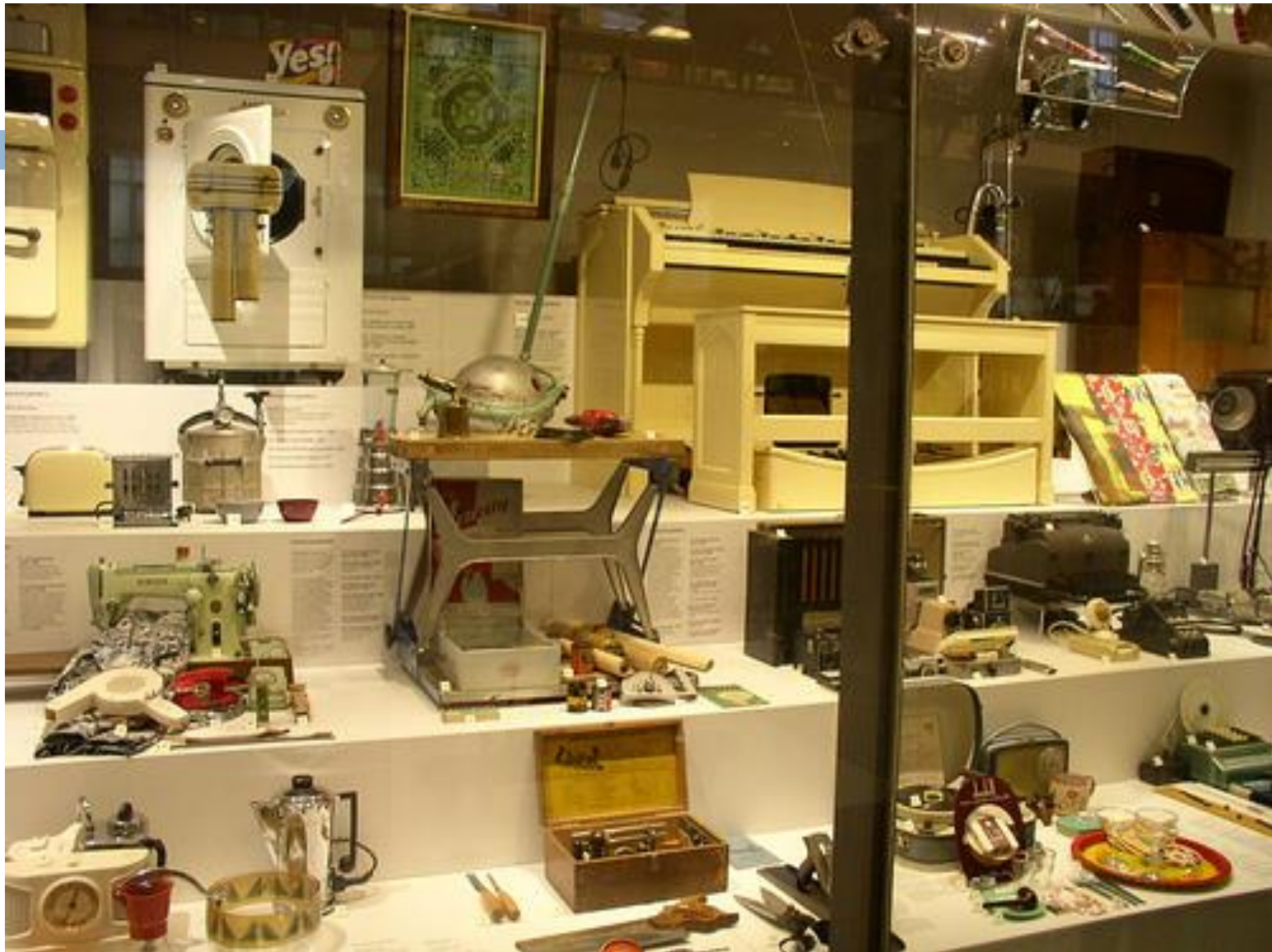
Exhibits, Science Museum