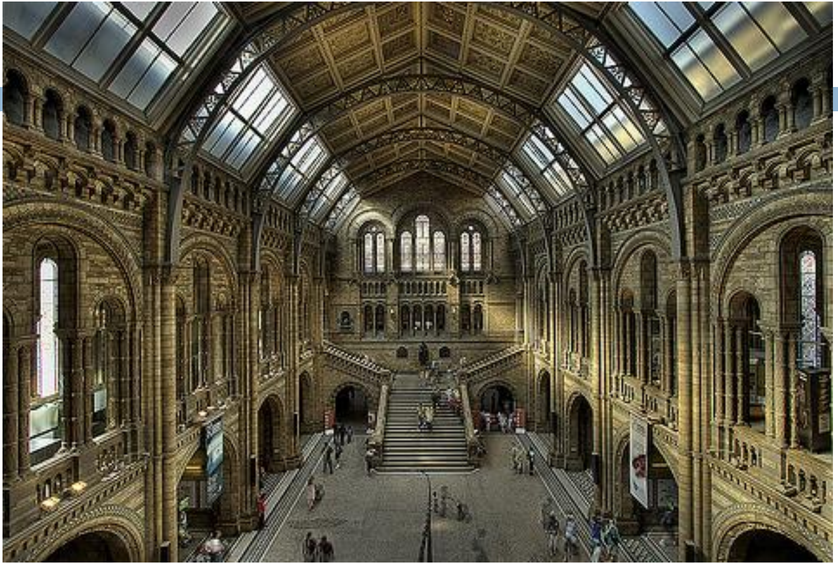
Natural History Museum, Interior