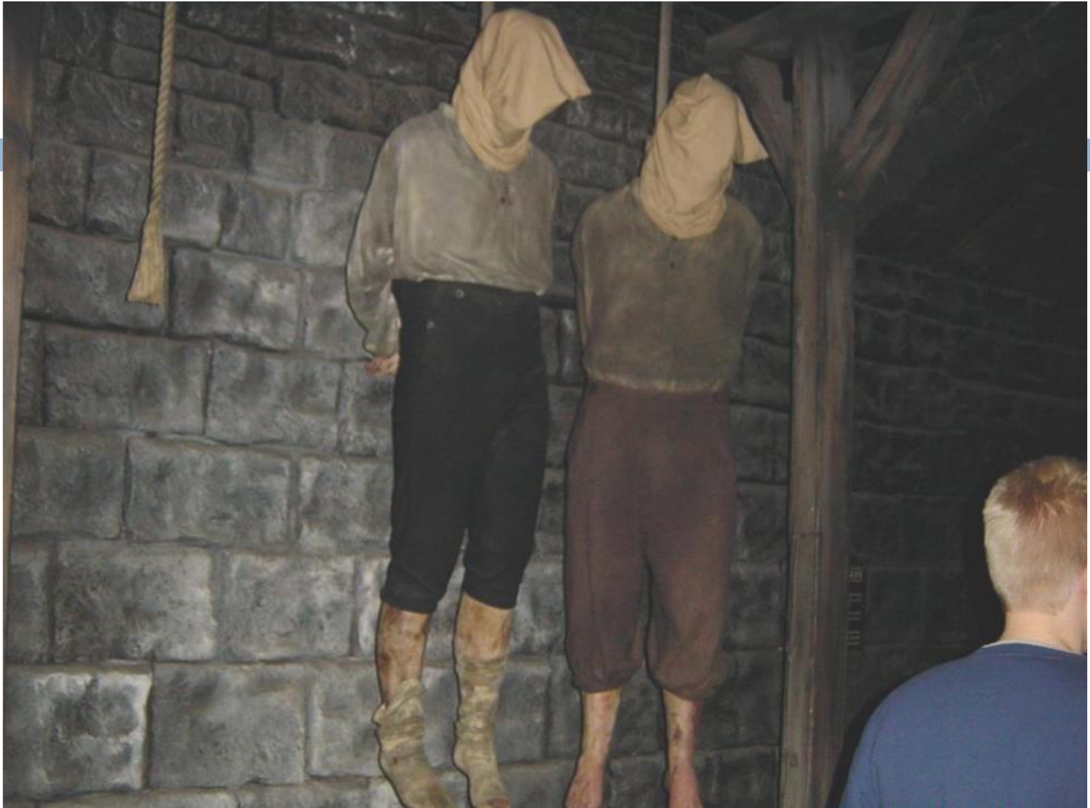
Madame Tussaud Museum