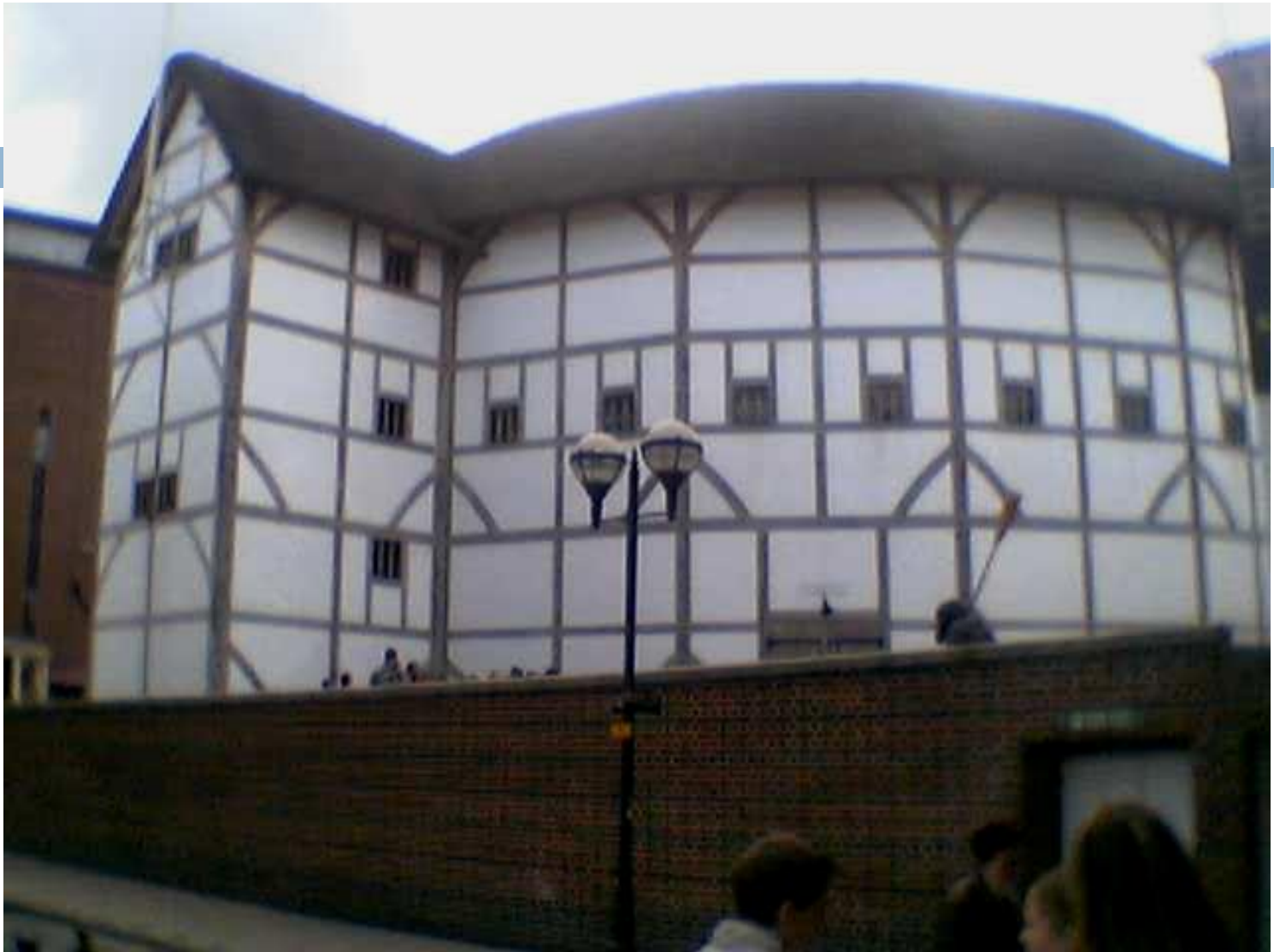
Shakespeare's Globe Theater