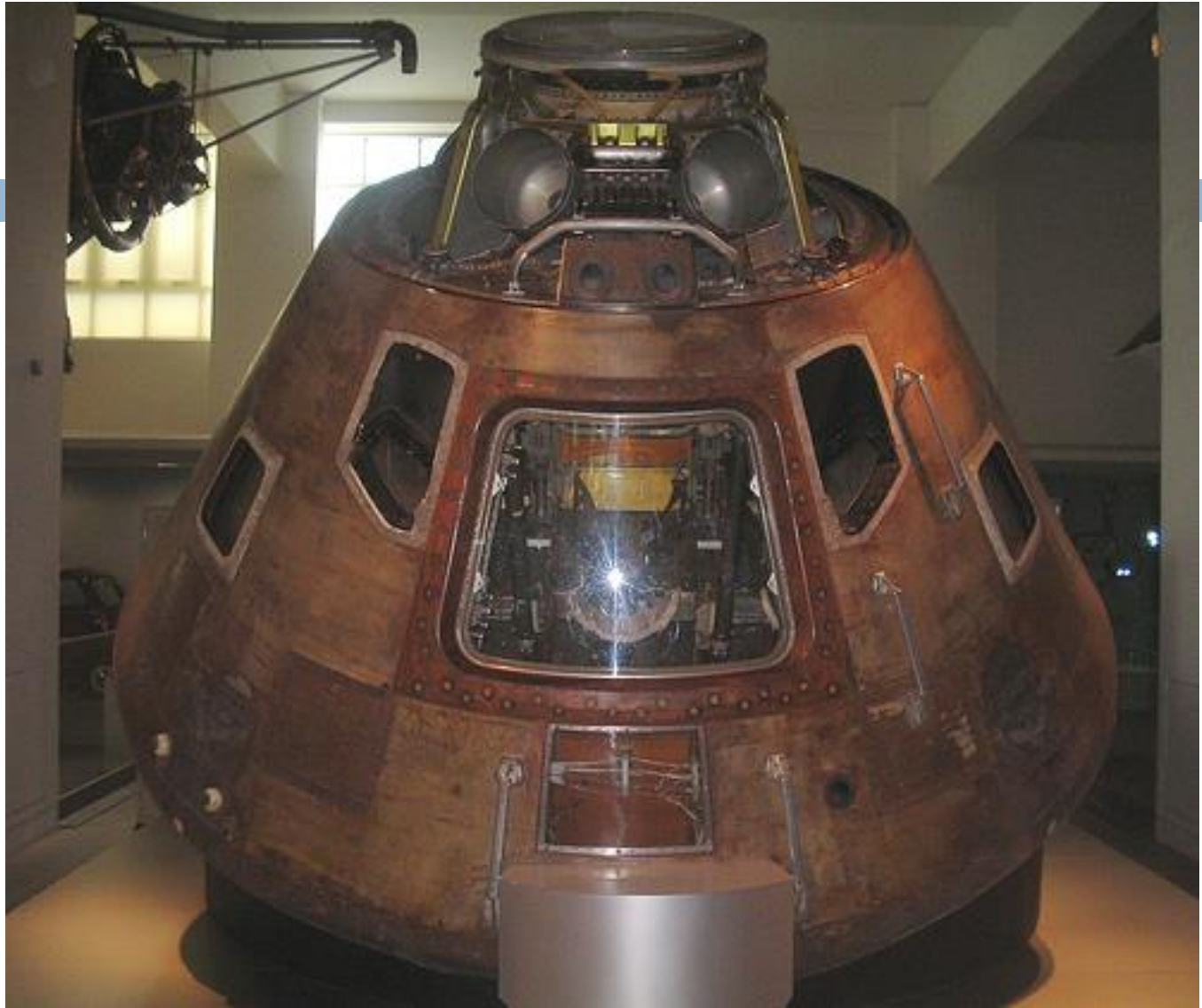
Exhibit, Science Museum