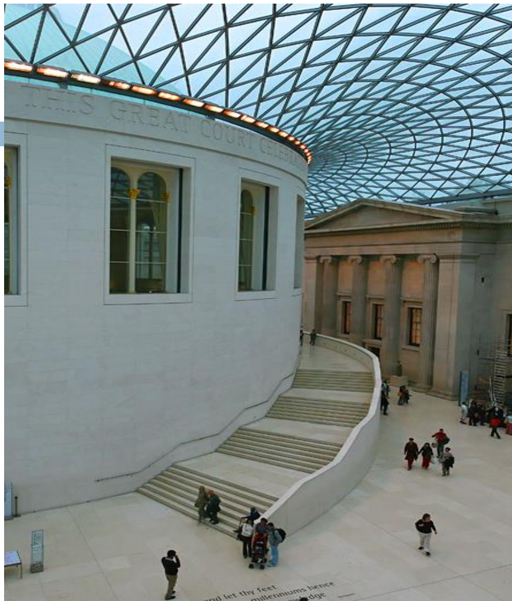
Elizabeth II Great Court