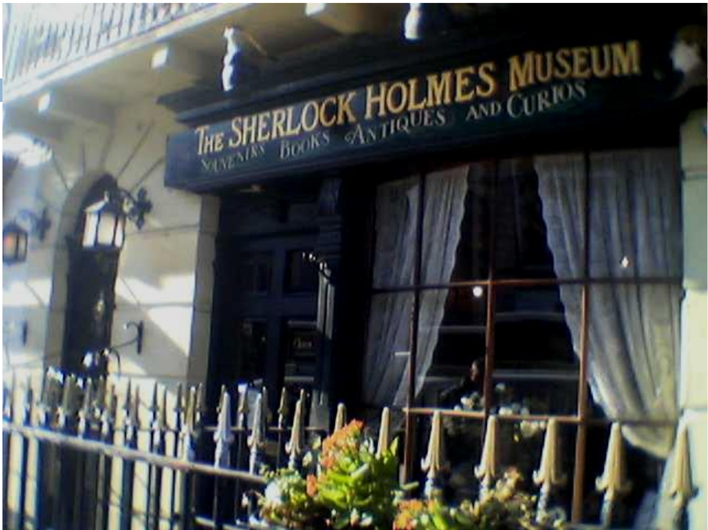
Sherlock Holmes Museum