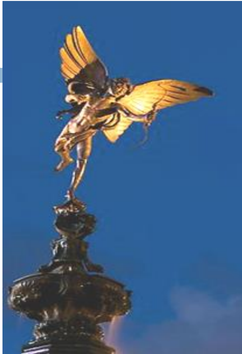
Eros Statue, Piccadilly Circus