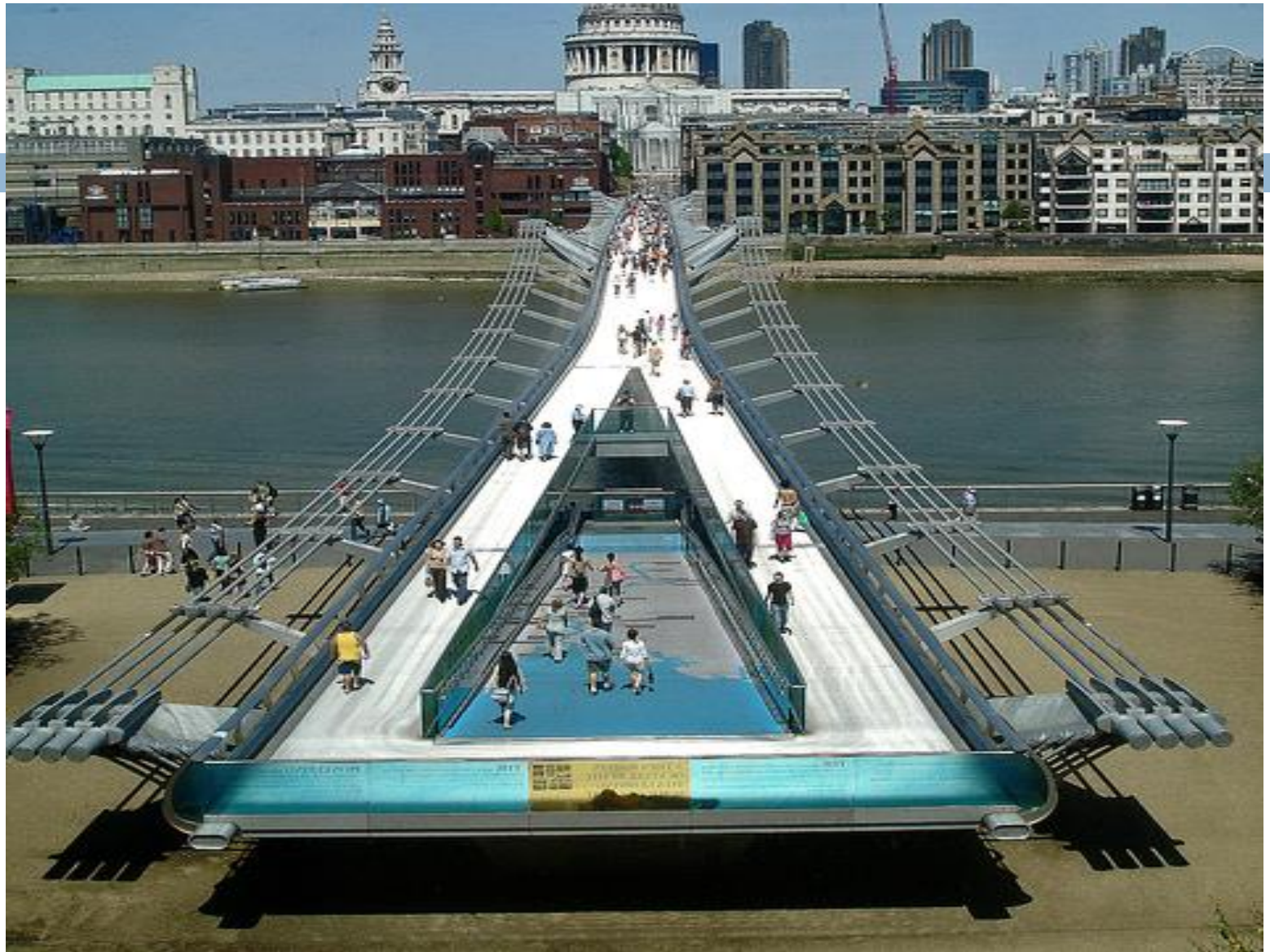
The White Path