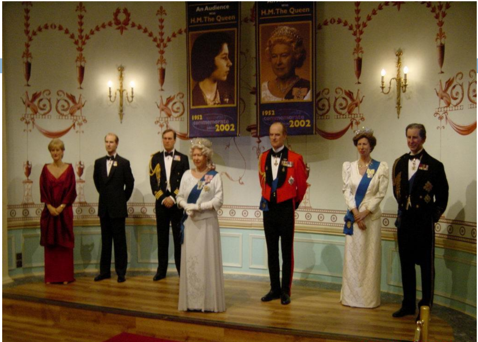
Madame Tussaud Museum