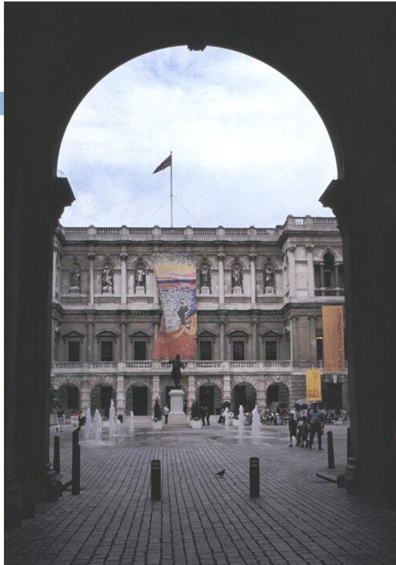
Royal Academy of Arts