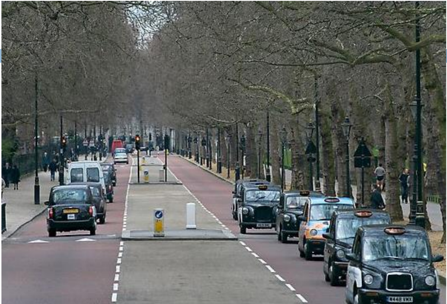
St. James Park