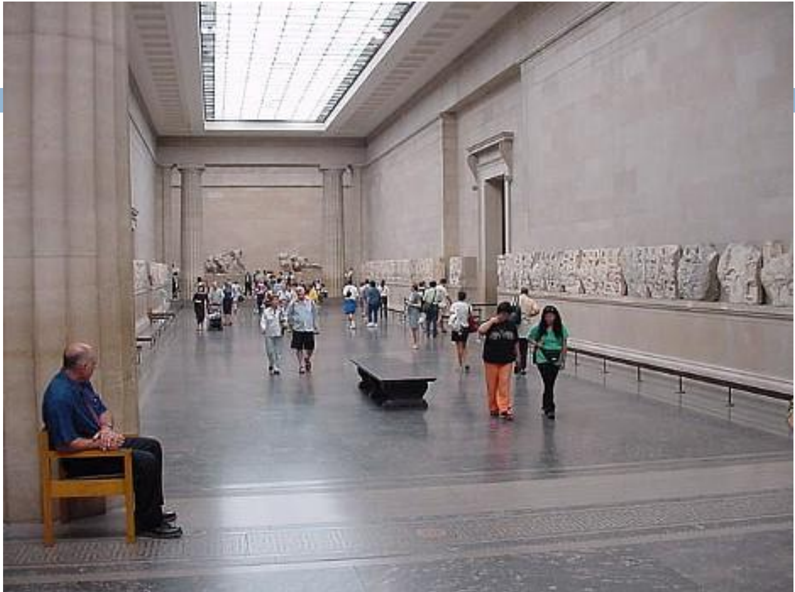
Elgin Marbles, British Museum