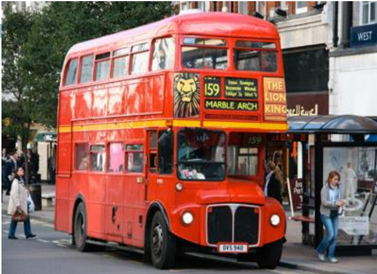
Double Decker Bus