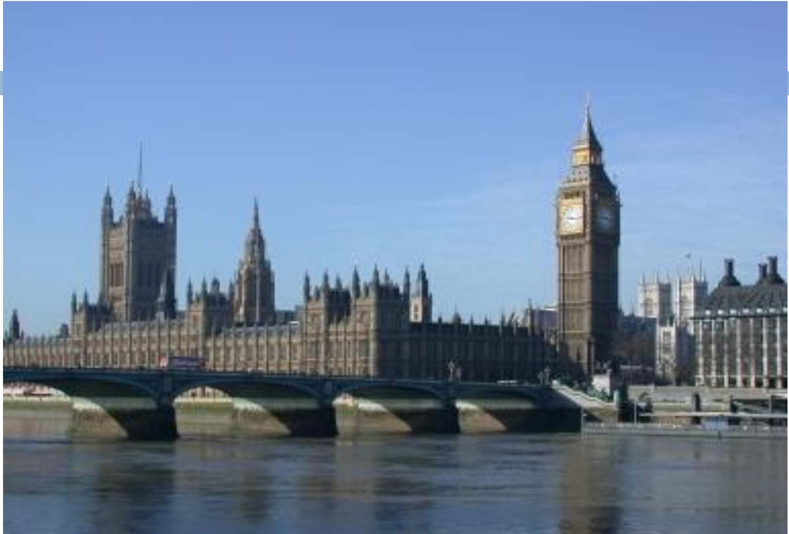
Houses of Parliament, Big Ben