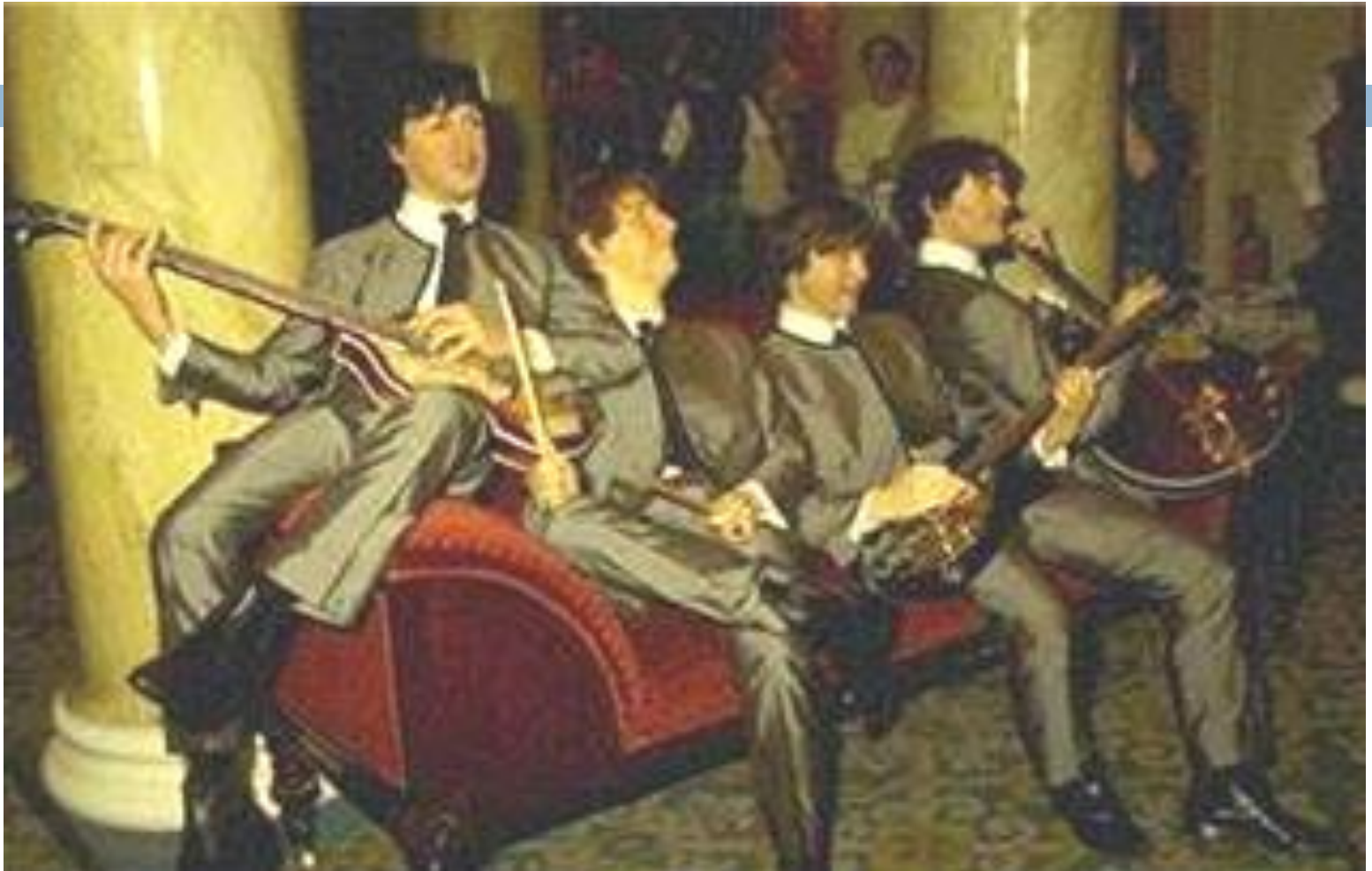
Madame Tussaud Museum