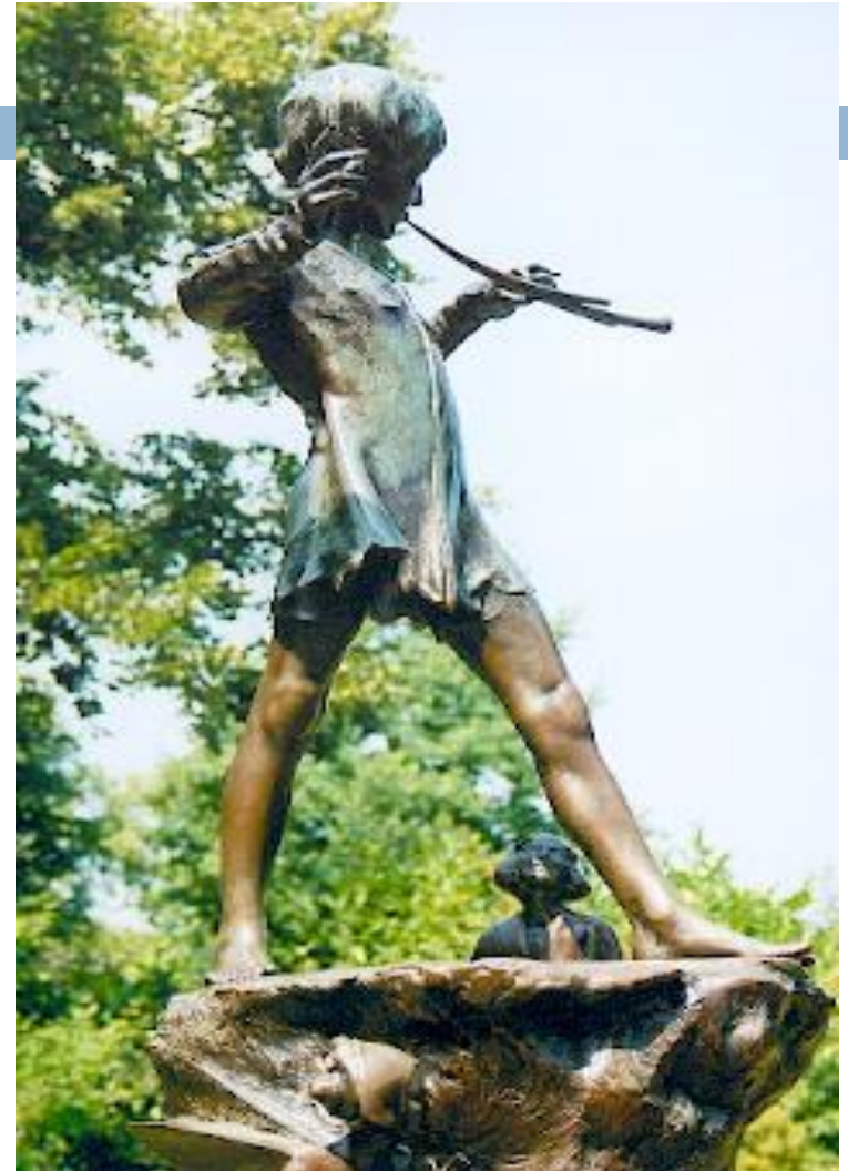
Peter Pan's Statue Kensington Gardens