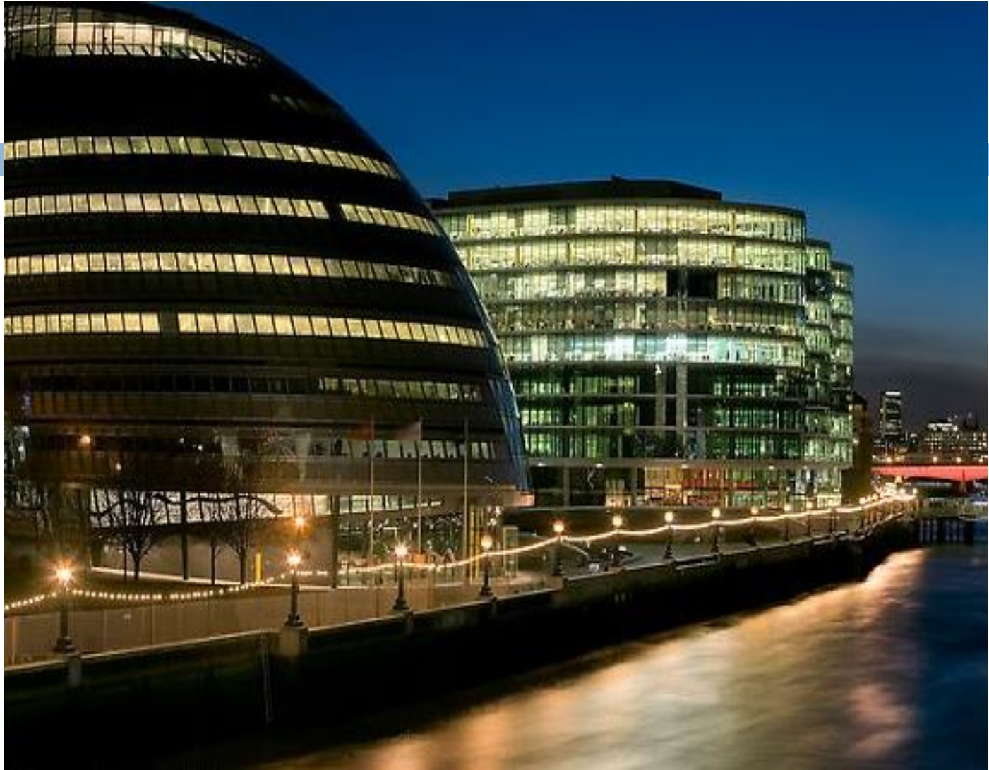
City Hall, River Thames