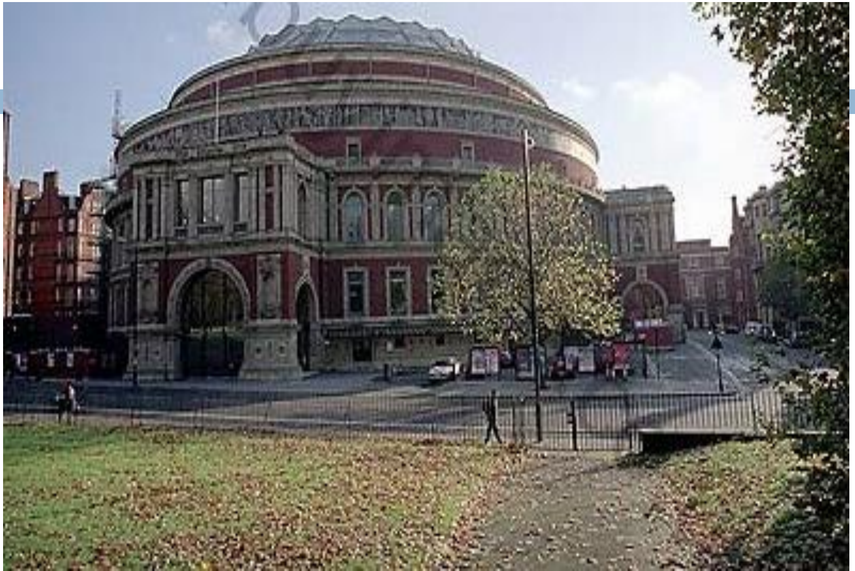
The Royal Albert Hall, Hyde Park