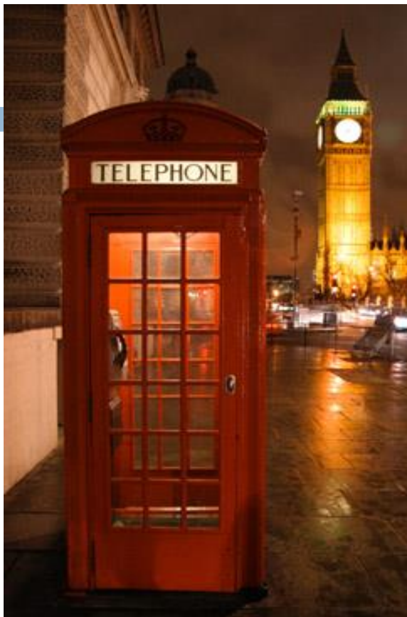
Red Phone Booth