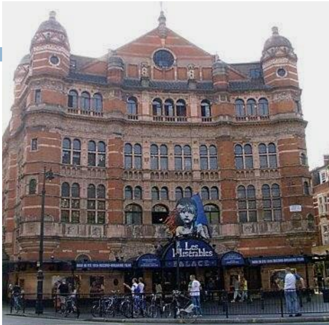
The Royal Theater