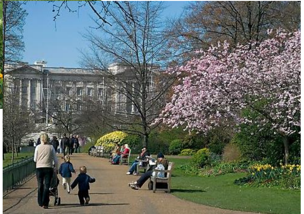
St. James Park