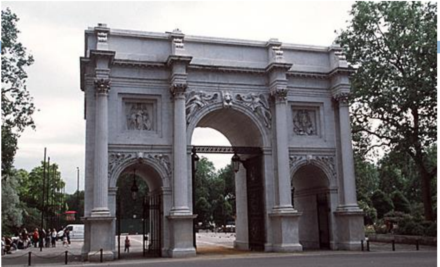
Marble Arch, Hyde Park