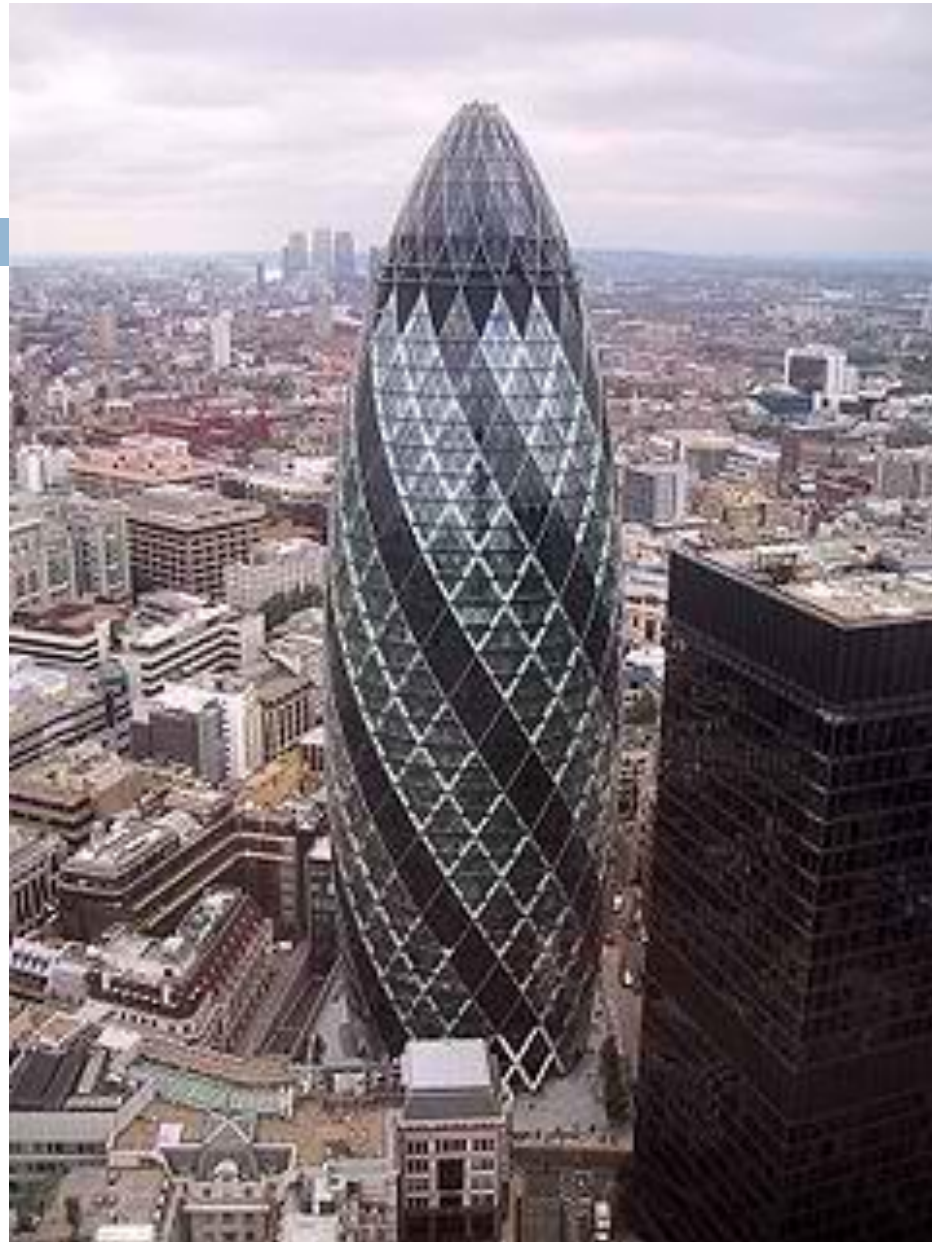
Swiss Re Tower