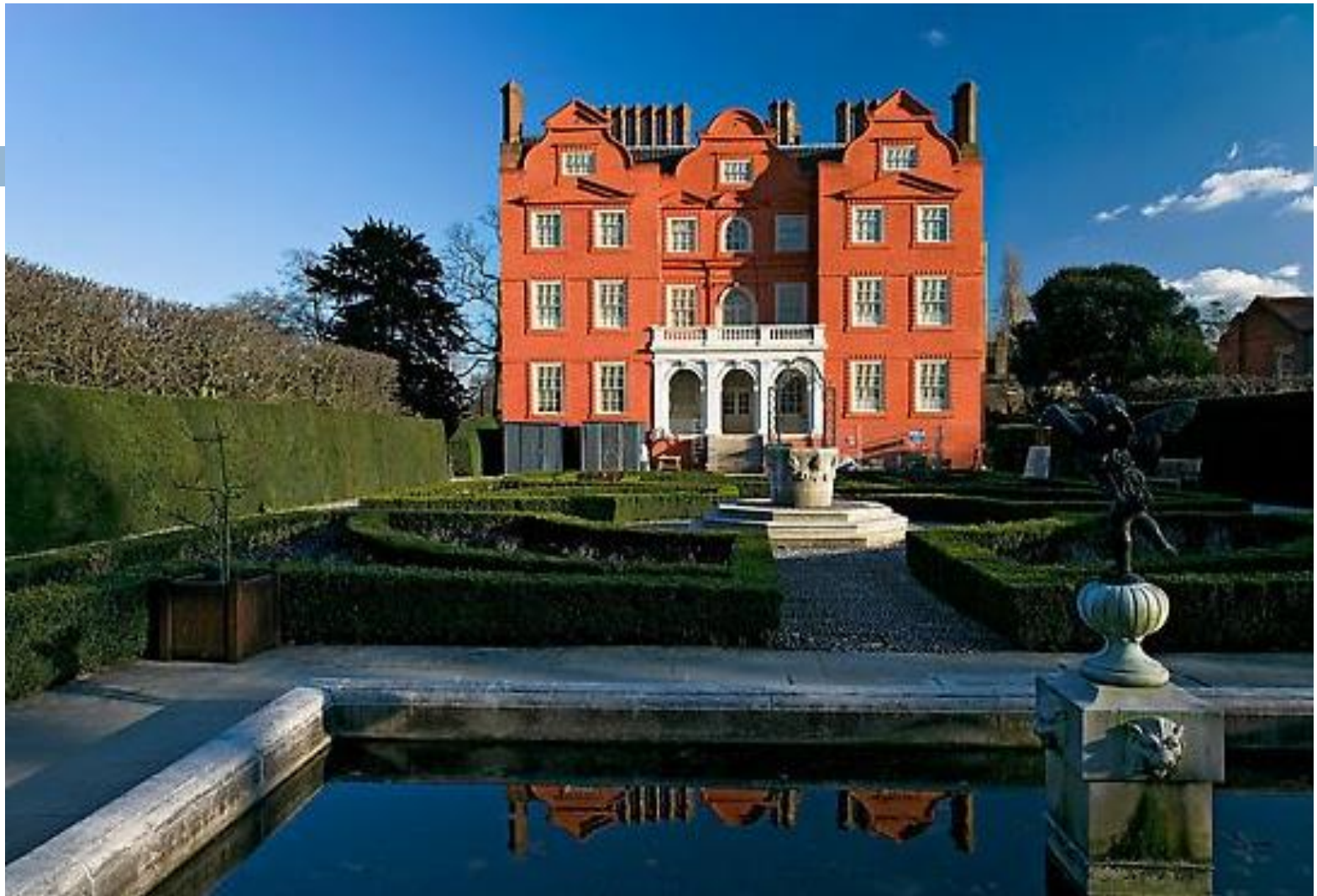
Kew Royal Botanical Gardens