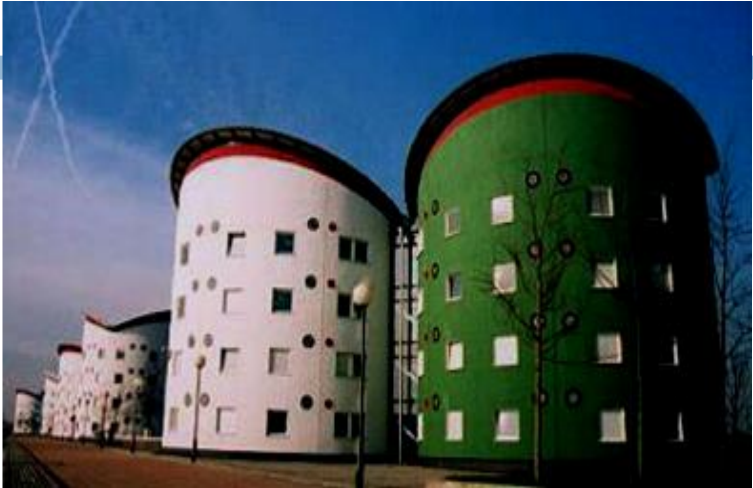
East London University