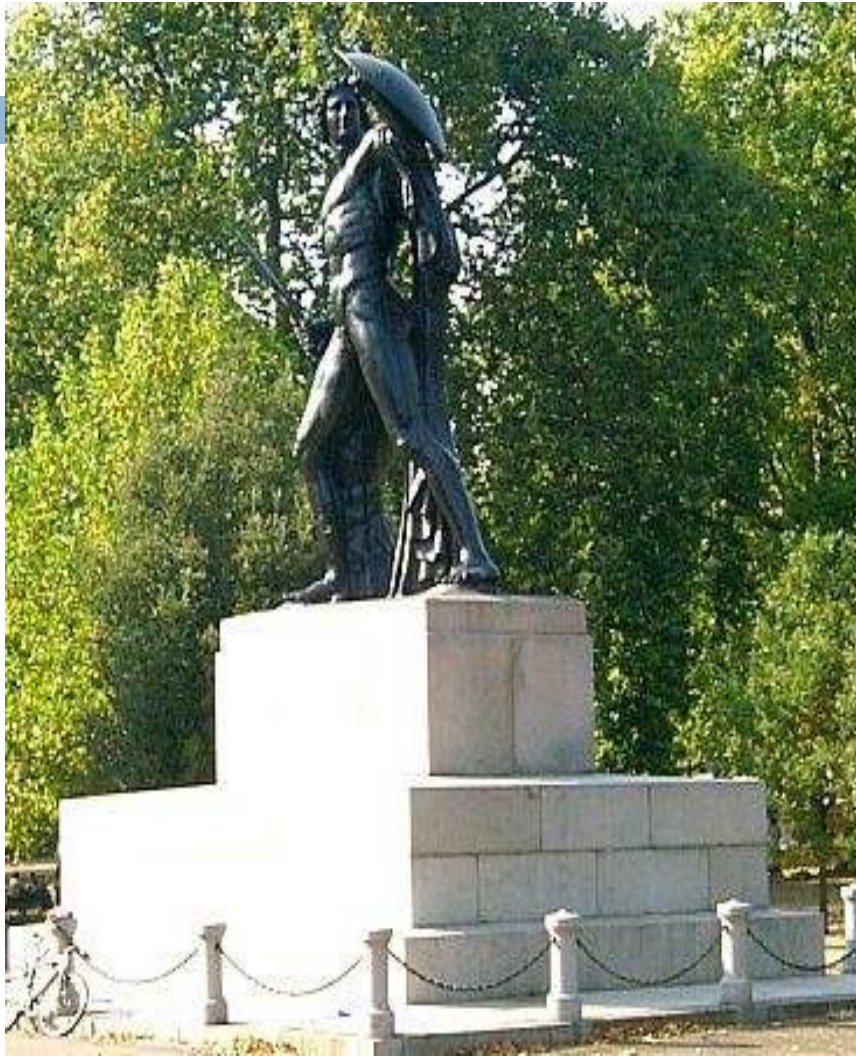
Achilles' Statue Hyde Park