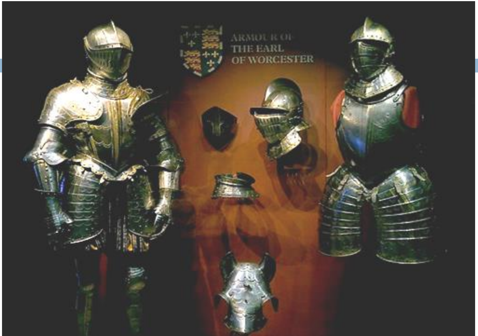
Armour of the Earl of Worcester, White Tower