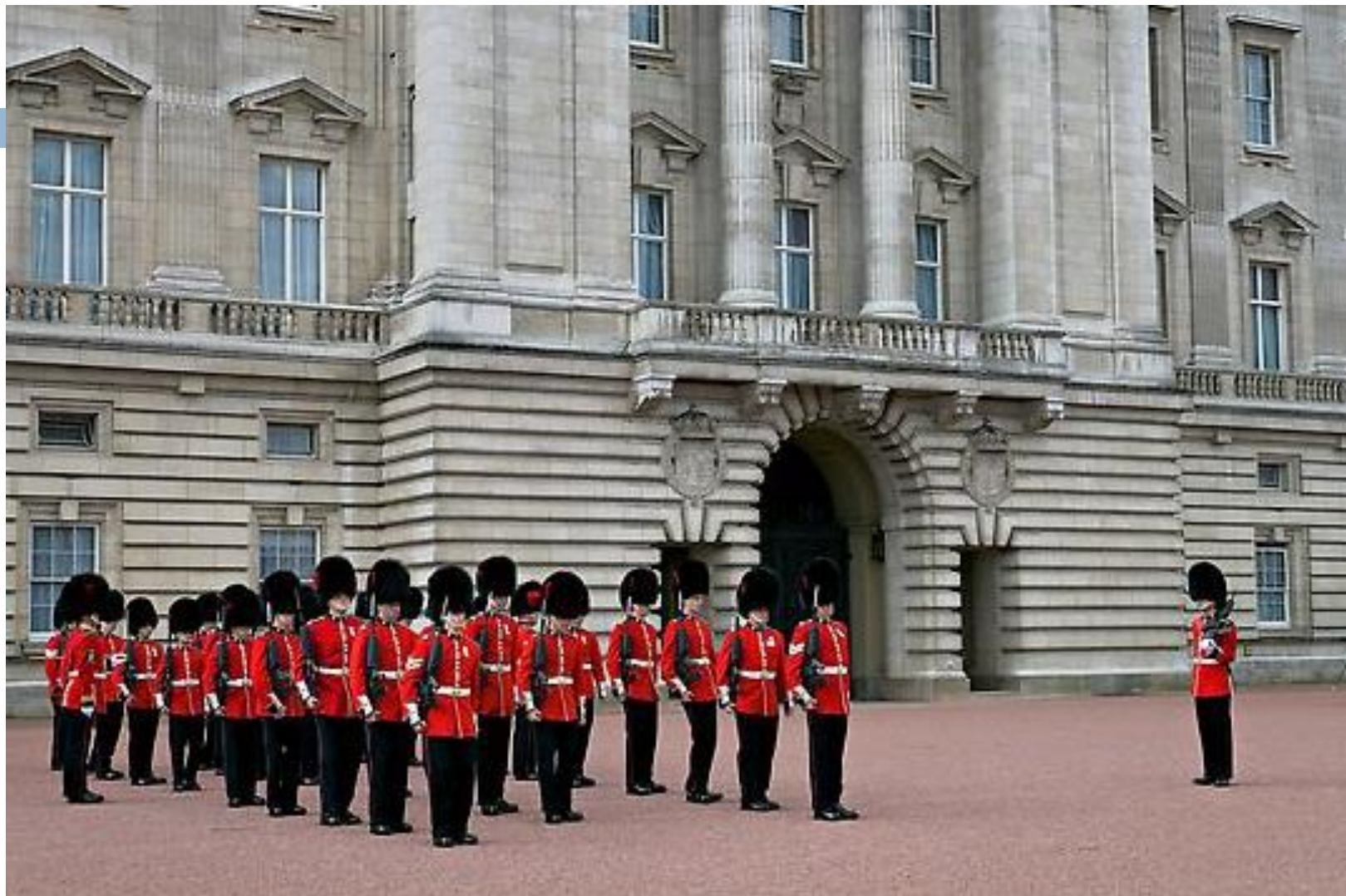
Change of Guard