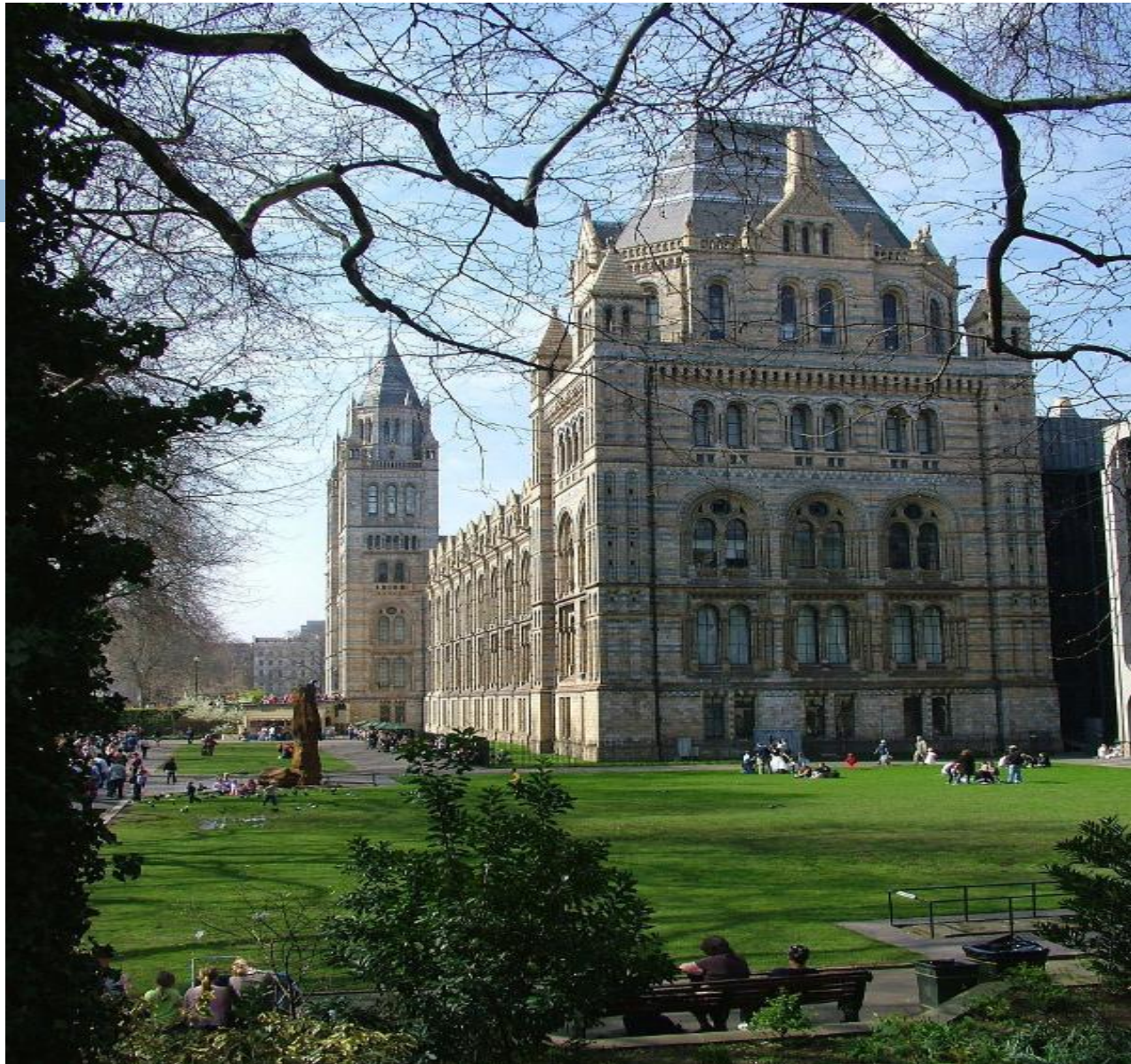
Natural History Museum