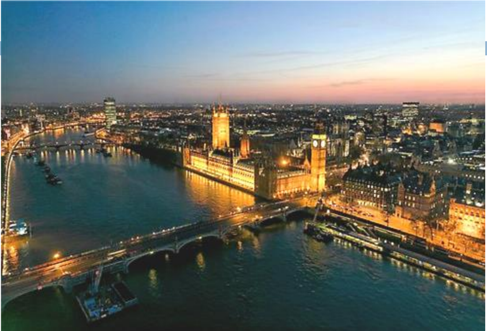
River Thames, Westminster Bridge, Palace