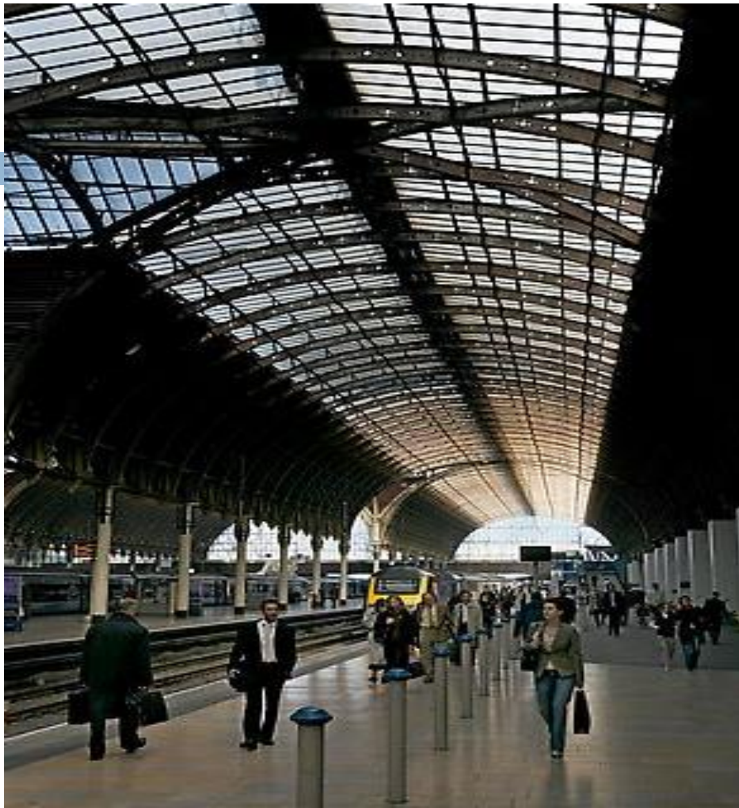
Paddington Rail Station