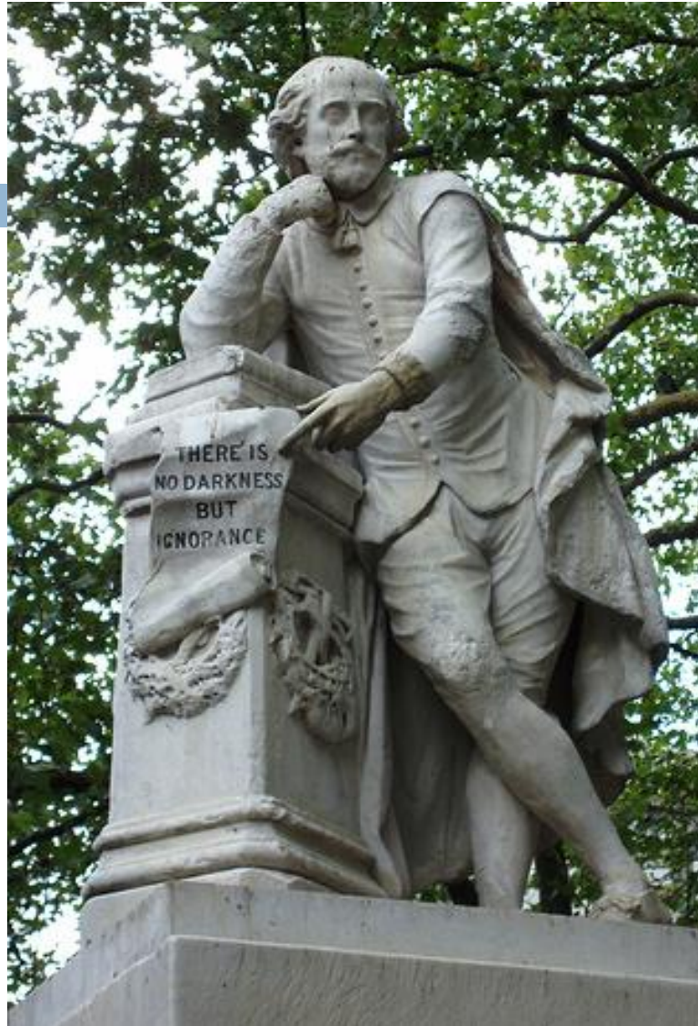
Shakespeare's Statue, Leicester Square