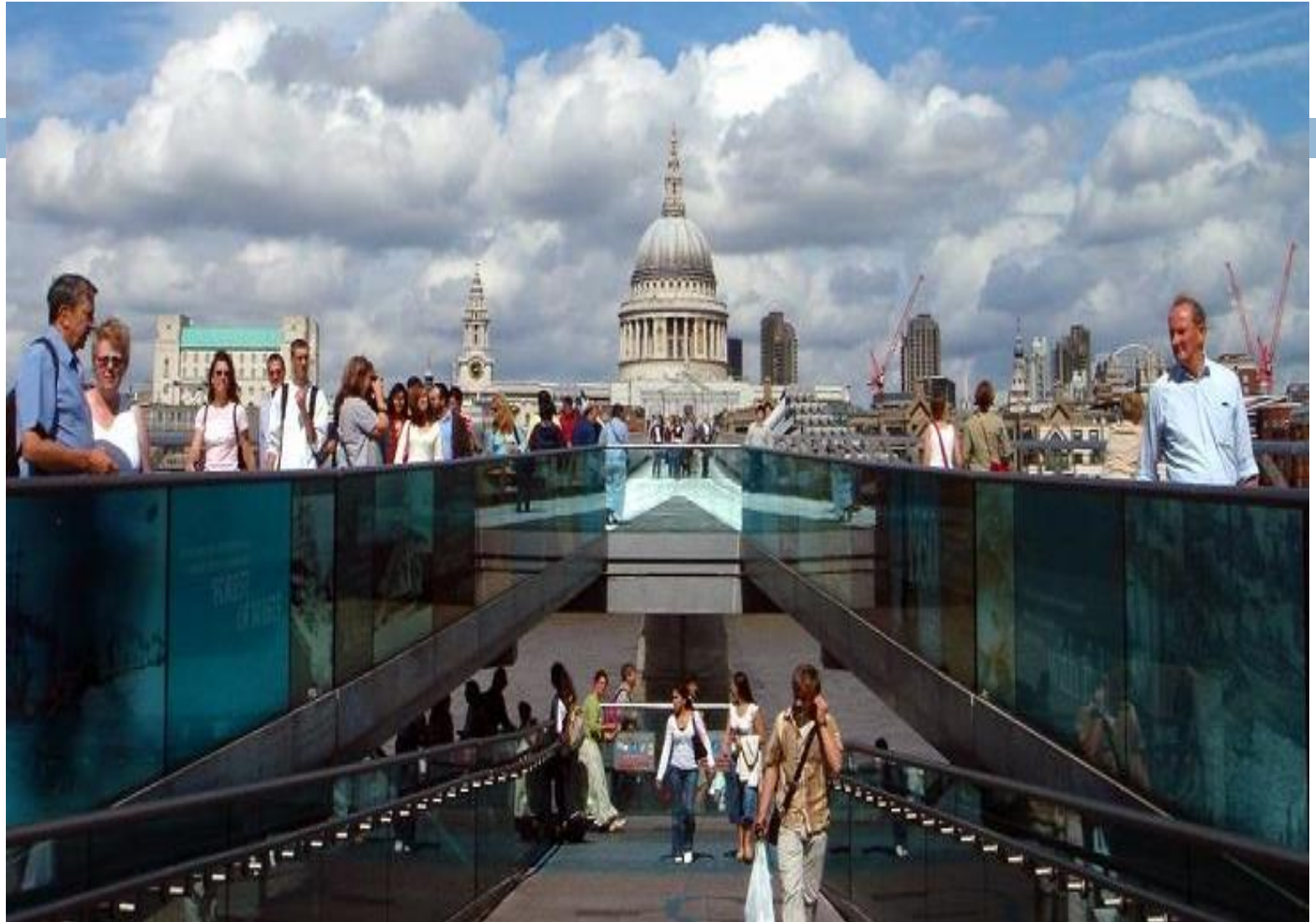
St. Paul's Cathedral