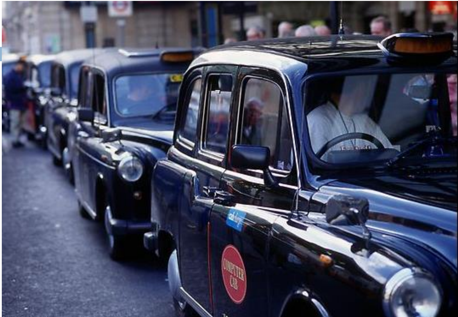
Black London Cabs