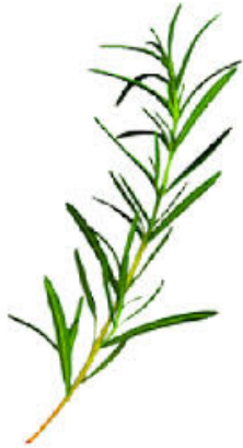
a twig or small branch with its leaves, flowers, or berries