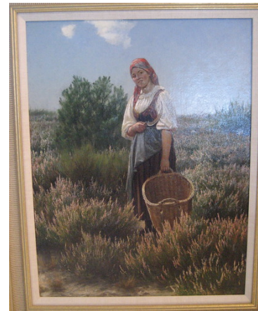
a person who does farm work for wealthy landowners