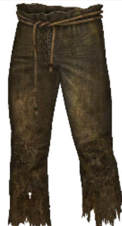
old and torn