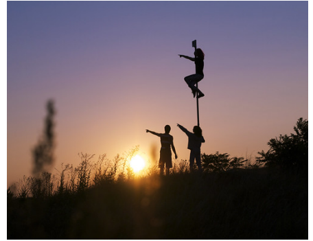
place or situation affording some benefit

24. weathered (adj) worn by long exposure to the air; weather-beaten.