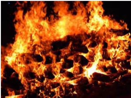
Shine brightly, flare up suddenly