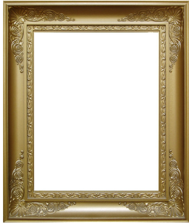
The lines and borders that contain the panels