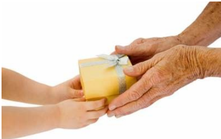
An inheritance; something handed down from an ancestor or from the past